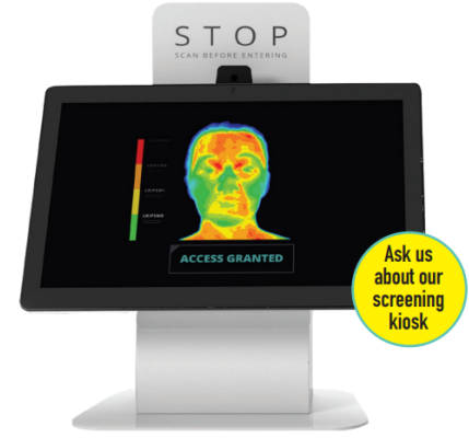
FICO is a certified reseller and is Partnered with Olea